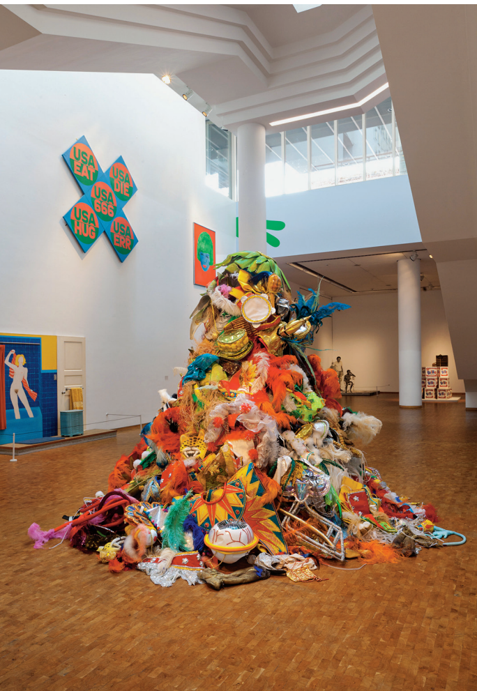
Left: Fraser's installation "Um Monumento às Fantásias Descartadas" ("A Monument to Discarded Fantasies," 2003). Below: a still from Fraser's "Museum Highlights: A Gallery Talk" (1989), with the artist in character as a docent at the Philadelphia Museum of Art. Opposite: a still from "Projection" (2008).

but dogged attempts to change audiences and the larger ecosystems they inhabit. And, if the events of the past year are any indication, these provocations have worked — even if most audiences don't fully realize that the world has caught up to Andrea Fraser.